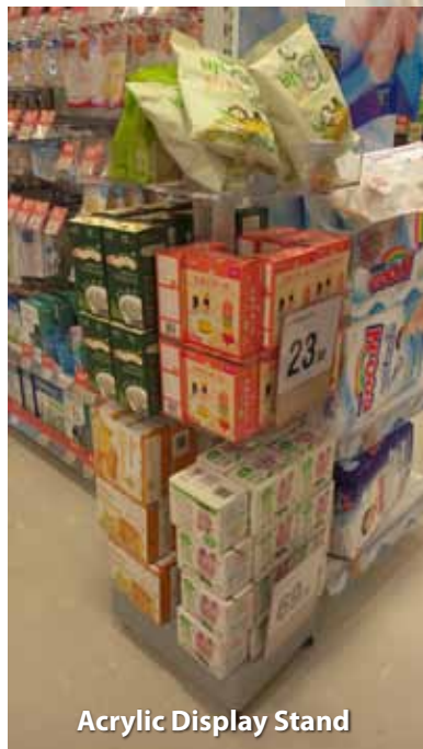
Acrylic Display Stand